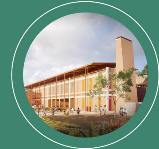
Infrastructure and Basic Services